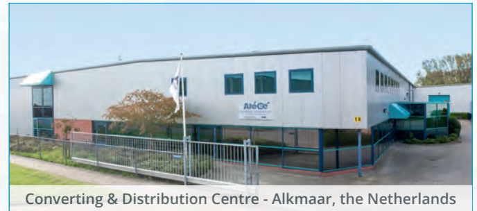
Converting & Distribution Centre - Alkmaar, the Netherlands