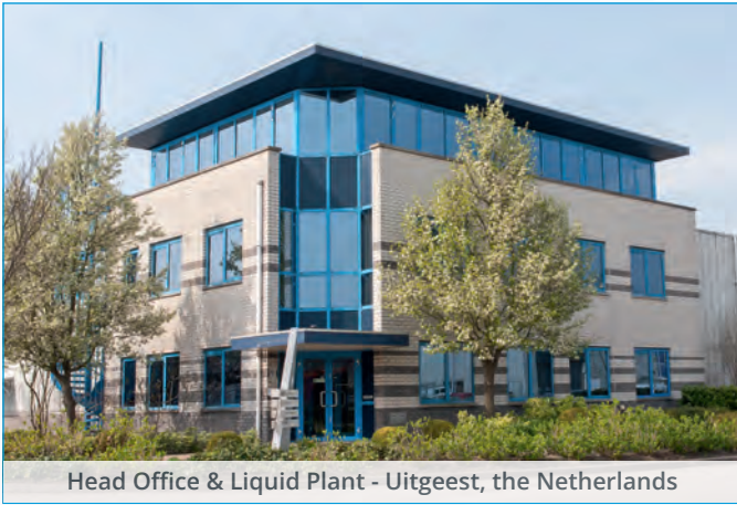
Head Office & Liquid Plant - Uitgeest, the Netherlands