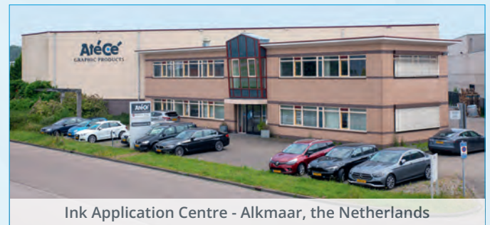
Ink Application Centre - Alkmaar, the Netherlands

In Alkmaar, AtéCé has a modern Ink Application Centre with a highly developed laboratory and with state-of-the-art equipment for testing printing inks and product innovations. At AtéCé we also have a professional mixing service for inks. In addition, we have a lot of in-house knowledge and we make the difference in the market with our colourists and application specialists.